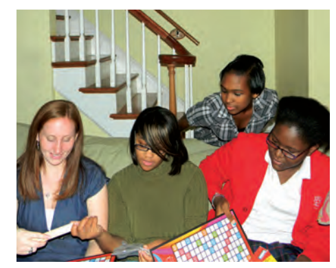
Girls Hope of St. Louis scholars