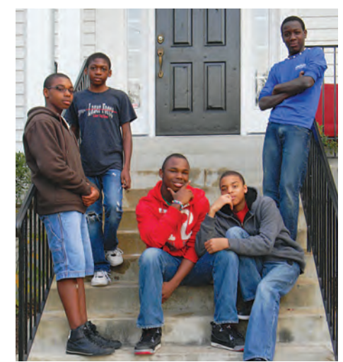
Boys Hope of St. Louis scholars

As anyone can plainly see, Boys Hope Girls Hope is certainly a place where hope lives, and indeed thrives.